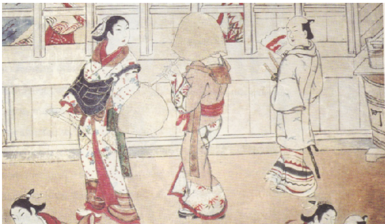
Figure 2: Shimabara yūroku-zu screen

IT: If you look at this painting (figure 2), you can't see whether it is a woman or a man. It is written down in documents, not particularly shakuhachi documents but normal documents so I think we can trust