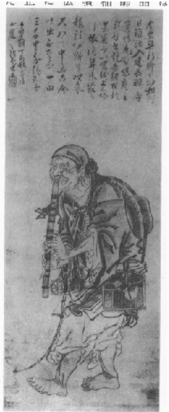
Figure 4: Nihon-ga Taisei vol 3 (Touhou Shoshain, 1931).

painting [several copies of this painting exist but not as well painted