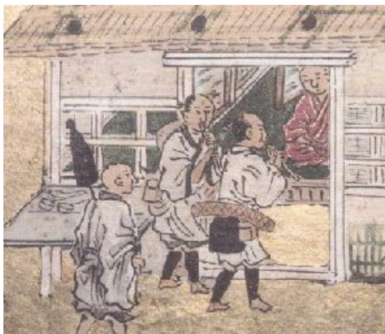
Figure 3: Rakuchū rakugai-zu screen by Kanō Eitoku. Detail of Shimogyō screen.

IT: Yes, with paintings you can see how they went about. Here there are several players together. It is before the Fuke sect's foundation. I find it very interesting what we can learn about this early era from the paintings. Thereby paintings become very important data as you can see how the landscape was at the time.