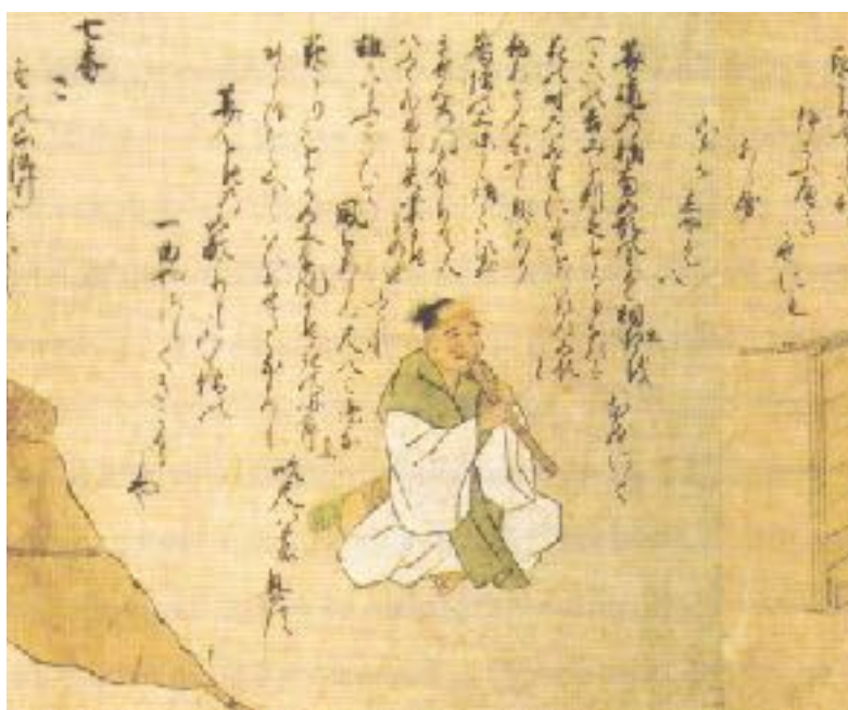
Figure 1: Sanjūni-ban shokunin uta-awase: komusō. Suntory Museum of Art.

IT: Yes indeed, and we can see how they were dressed and in what context or situation they played.